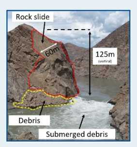
Big Bar rock slide.

Our preliminary work on water temperature is gaining prominence as climate change is working in concert with a range of factors that are resulting in what is referred to as cumulative effects. The most recent factor of concern was the rock slide near Big Bar on the Fraser River.