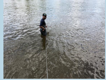
Figure 1 c. HOBO logger fully deployed