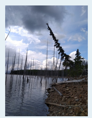
Location of logger at Tatsha Reach, note the Coast Mountains in the background

Because we wanted to get a sense of the geographical variability of the Nechako River system, selection of sampling sites for our pilot season took us to some pretty remote and stunningly beautiful places in the Nechako Watershed. We visited the shores of Tatsha Reach on the Nechako Reservoir, the Nadina River, near the extinct volcano Mt Nadina, the Nechako River near Vanderhoof, and immediately downstream of the Skins Lake Spillway.