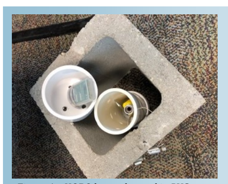
Figure 1 a HOBO logger housed in PVC pipe and attached to a small cinder block

To assist with future water temperature modelling efforts, we began a pilot project designed to test automatic water temperature data loggers in the Nechako Watershed. This season we deployed 8 self-logging HOBO water temperature loggers (Figures 1a,b,c) at various sites in the Nechako watershed (Figure 2) to capture spatio-temporal patterns in water temperatures and assist with future Air2Stream modelling efforts.