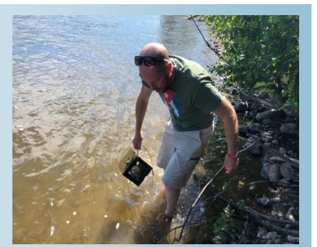
Figure 1 b. HOBO logger on its way to start recording data.