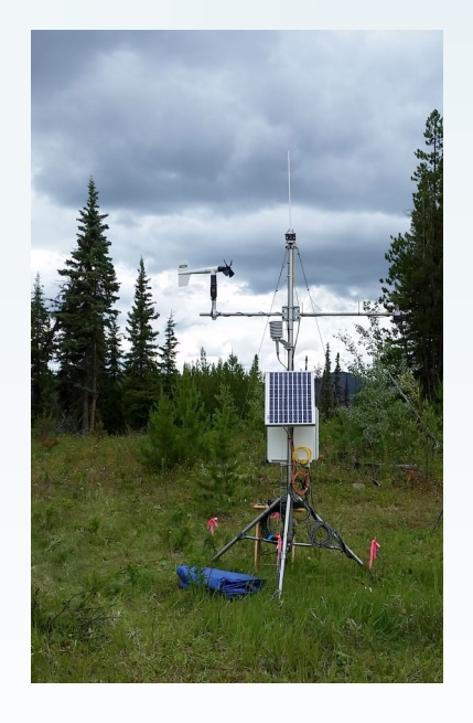
An NHG weather station, this one at Tatuk Lake in the upper Chilako River Watershed