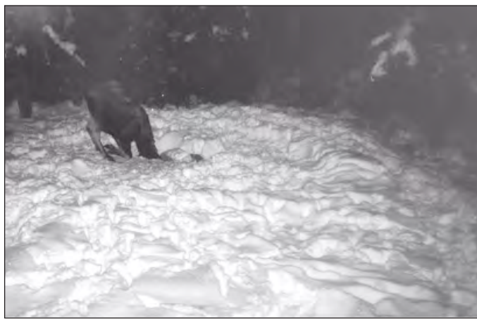
Figure 3. A Moose of unknown sex and age kneels at the study lick in the John Prince Research Forest, North Central British Columbia, February 12, 2003.

Moose utilized the lick regularly in late spring and early summer during each year of this study. Although we could not include the data for the spring/summer of 2004 because of missing date/time imprints on our photographs due to a camera malfunction, our photographic record indicated a large increase in summer use in 2004. With the exception of the first year of this study (2002; a December 2001 peak may have gone unrecorded), Moose utilized the lick regularly during the winter months of December (2004) and January (2003 and 2005)