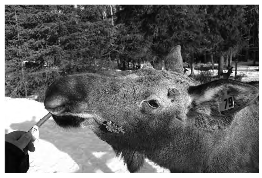
FIGURE 2. When Moose browsed shoots, they mouthed the shoot until they appeared to find the desired bite diameter, then they cropped the shoot from the stem. Shoots were then manipulated in their mouths until the tips were either consumed (tips without willow rose galls) or dropped (tips with willow rose galls).

that a determination could be made as to which shoot (the one with the gall or the one without the gall) had been selected first and at what diameter the shoot had been browsed. Stems were bagged following the offering and another set of shoots was presented to the Moose. The feeding trial took approximately 60 minutes.