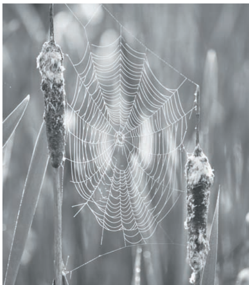
Figure 1. A spider web very typical of what I found during the first hour of my walk in the wetland near Valemount, BC.