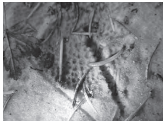
Figure 2. An impression of metacarpal dimpling from a porcupine captured by the foam track plate during field trials.

In a separate test, running water from a tap on the foam plate for 10 minutes had no obvious affect on the plate or dog tracks imprinted in the plate. Furthermore, the wetted foam plate maintained its ability to register further impressions. Freezing the