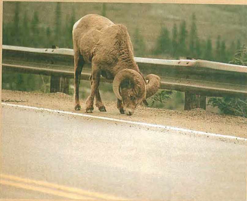
This mountain sheep is licking minerals from the soft shoulder along the side of a rural highway.

Many States, including Montana, are studying alternative strategies for winter road maintenance, such as applying liquid chemical deicers instead of abrasive salt and sand. For more information, see the white paper “Past and Current Practices of Winter Maintenance at the Montana Department of Transportation (MDT)” at www.mdt.state.mt.us/departments/maintenance/docs/wintmaint_whitepaper.pdf .