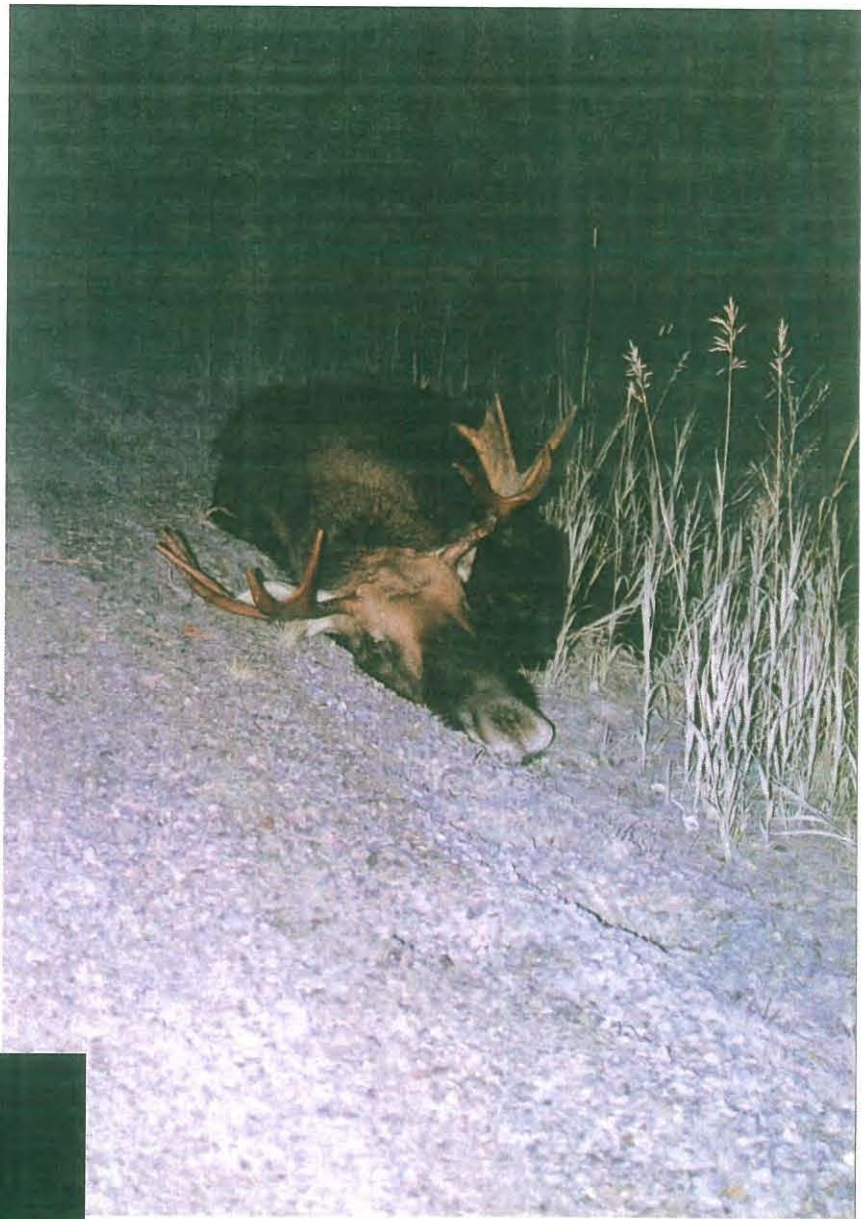
Dexter P. Holder

Although the jury is still out on what makes these sites so attractive to hoofed animals, the fact is that animals are drawn to roadside licks despite the dangers of entering the transportation corridor. If animals