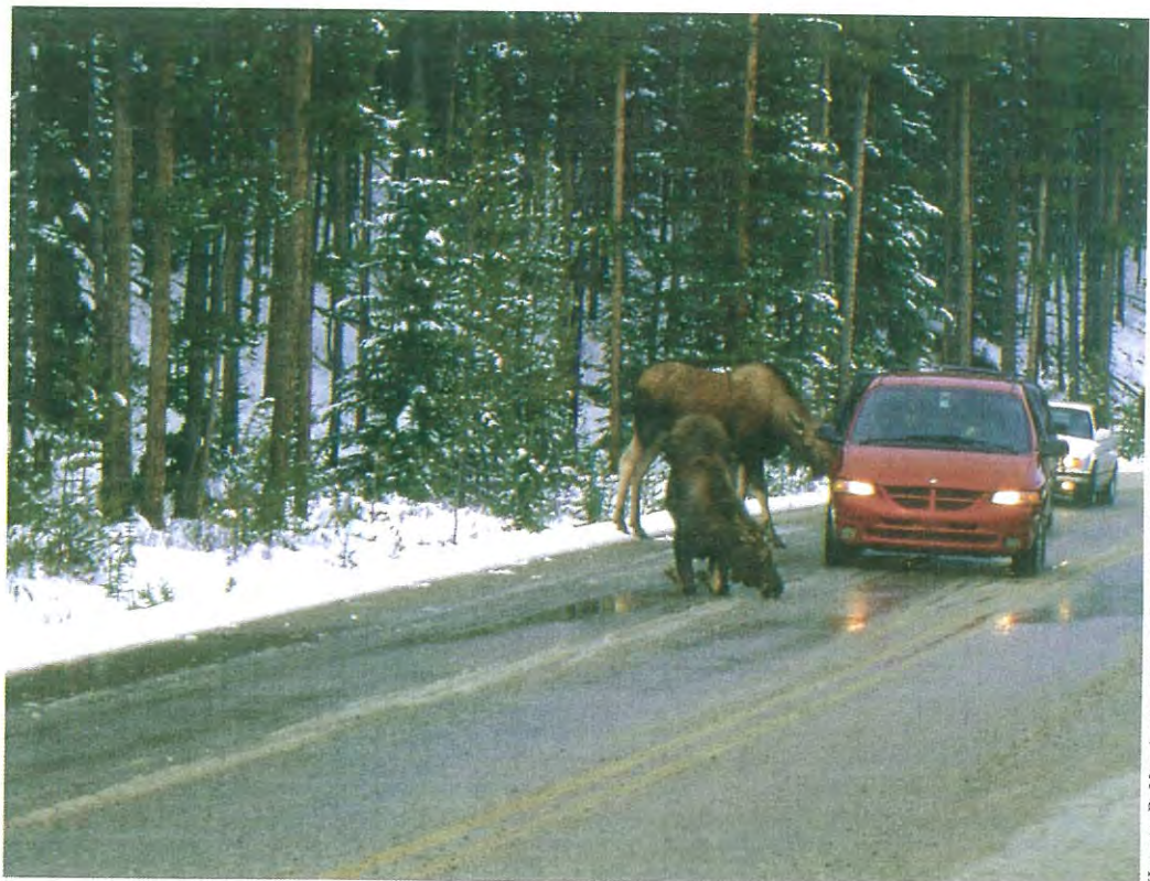
Hughes B. Massicotte, University of Northern British Columbia

A calf moose is learning a risky behavior from its mother. To obtain minerals lacking in their winter diets, these moose are licking chloride-based deicing materials from a rural highway, as motorists slow to drive around them.